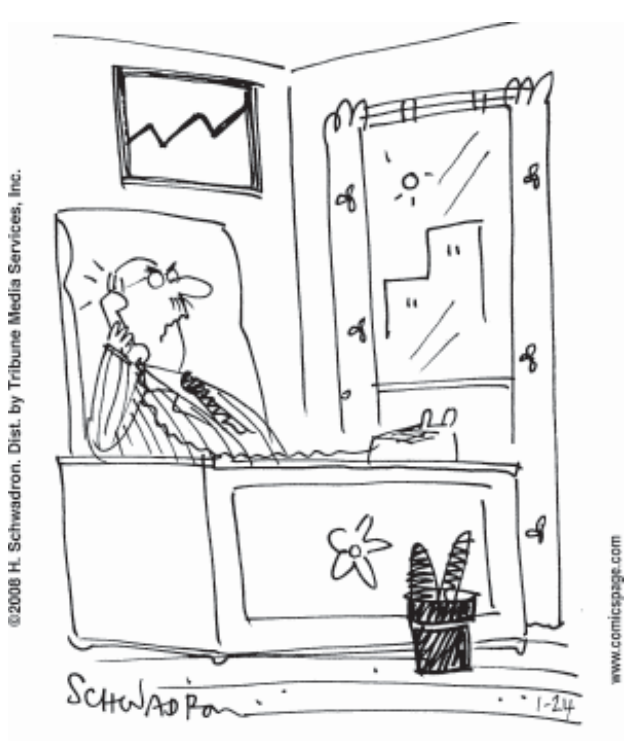
"You've been on hold for an hour. Would you like to speak to a phone rage specialist?"